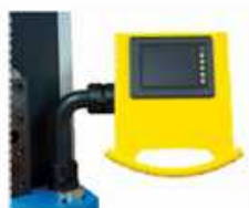
TSD Interactive Screen display